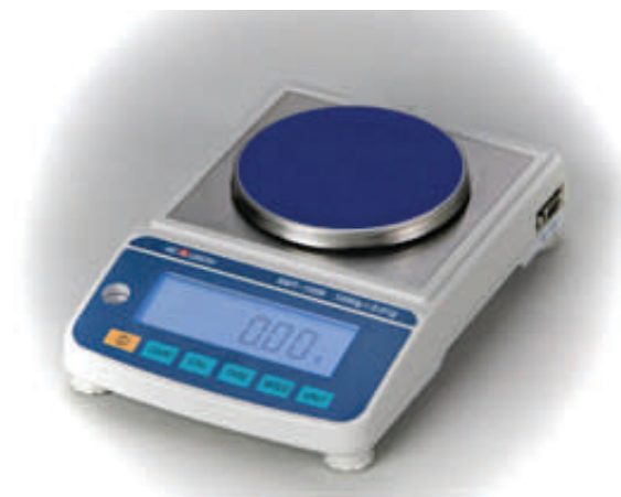
RS-232 Interface for transmitting weight, count or % upon stable weight reading