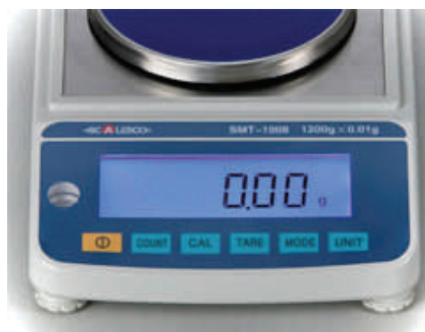
Big 0.75"H weight digits with blue back light display

The SMT-1008 precision balances series offers a wide range of use and applications for determining the weight of liquids, powders, and light weight items that require accurate weighing. A cost effective, durable balance for use in industrial, postal, laboratory, research, educational industries. Provides standard weighing plus a simple counting and percentage weighing application.