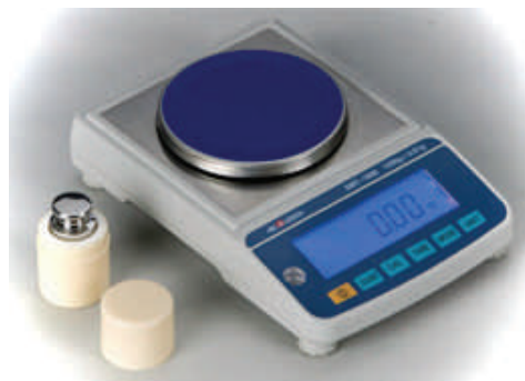
Shown with included calibration weight