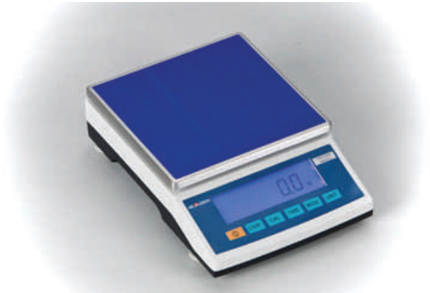
Model SMT-1028 Economical Precision Balance