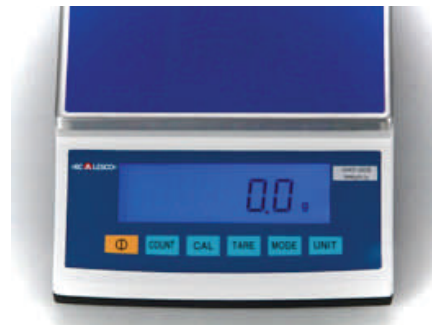
Big 0.75" H blue back light display