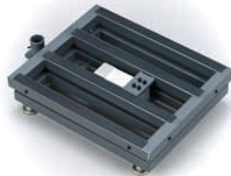
Heavy Duty Base Construction with powder coat paint for years of use