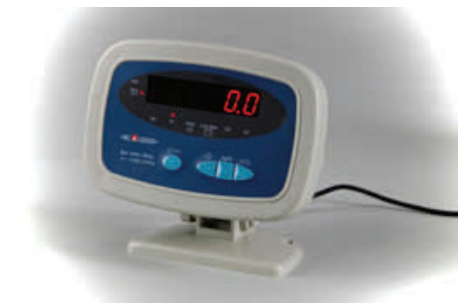
Large LED Display

The SMT-2012 general purpose scale is designed for the most heavy industrial use within the warehouse, at an affordable price. Rechargeable battery operation provides up to 35 hours of use before charging.