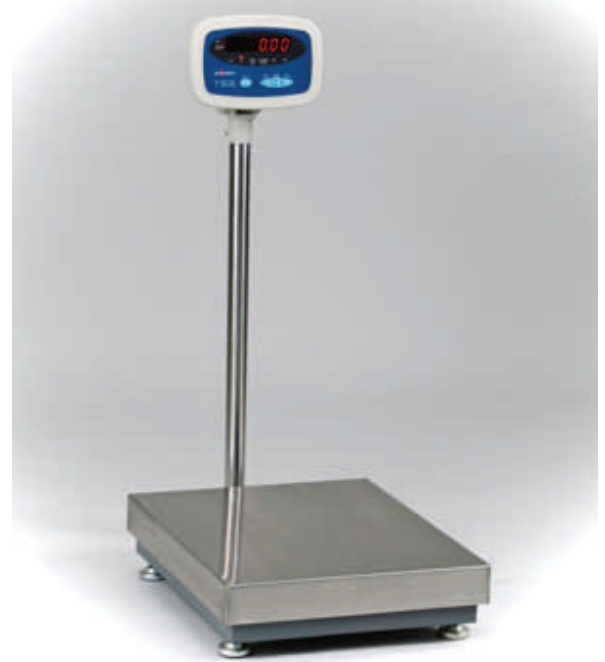
SMT 2012 assembled with 29" Column Post