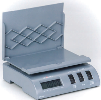
Letter tray for large envelopes and tubes