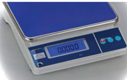
Large 0.75" H weight digits with blue backlight display