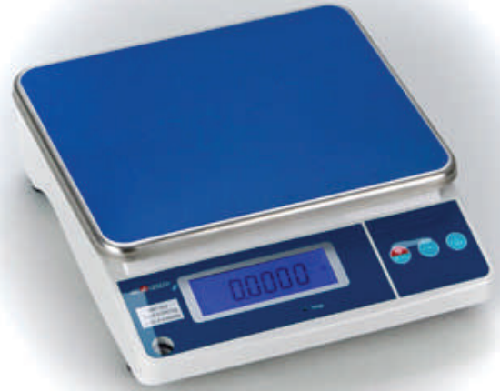
Model 262 Precision Balance and Counting Scale