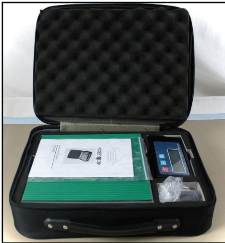
Includes nylon carrying case with added protection for transit. Light weight at only 10.5 lbs and convenient size of 15" x 12" x 3.25" for portability.

The Model 298 bench scale is a cost effective solution for any portable general weighing applications. Great for weighing small cylinders or fire extinguishers.